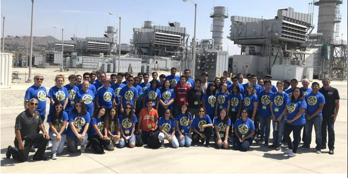
STEM PULL, July 2019, Riverside, CA.

This was our fifth year hosting a full conference for educators in our region. The premier STEM focused educator conference in the Inland Empire, Educator STEPCon 21 went fully virtual. Held over two days on October 5 and 6, 2021, the conference attracted 169 registrants that included classroom teachers, district staff, administrators and district and county education staff. With the persisting challenges presented by the pandemic, including a severe shortage of substitute teachers across both counties, we were pleased with the participation level at this year's event.