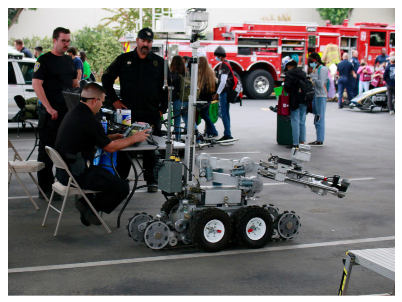
Outdoor Exhibits, Student STEPCon 21, Riverside, CA.