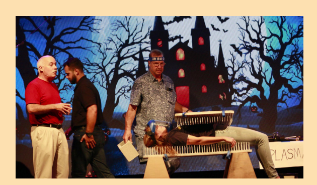
Science Show, STEPCon21, Riverside, CA.

"What I liked most about STEPCon21 was that it made me look inside myself and what I wanted to do." (Student Attendee, STEPCon21, October 8, 2021)