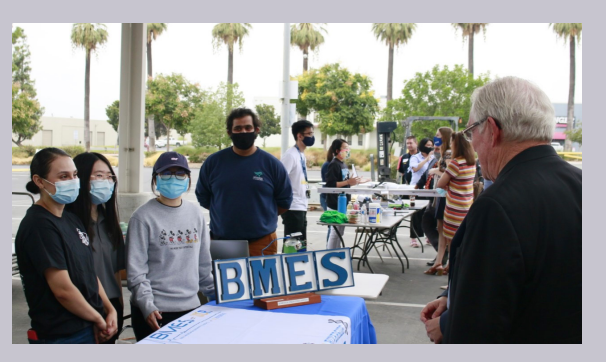
UCR BioMedical Engineering Society (BMES), STEPCon21, Riverside CA.