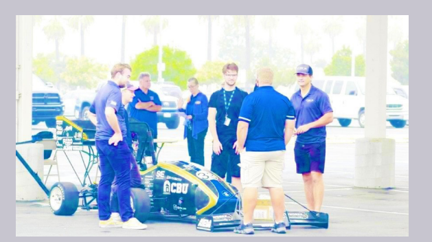
CBU Society of Automotive Engineer (SAE) racer,, STEPCon21, Riverside, CA.