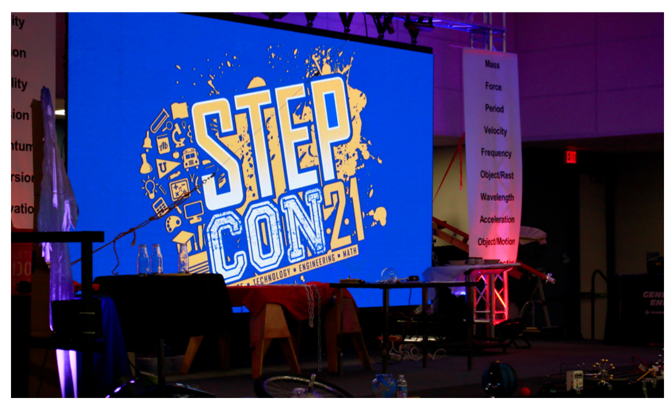
Set up for the Science Show, STEPCon21, October 8, 2021