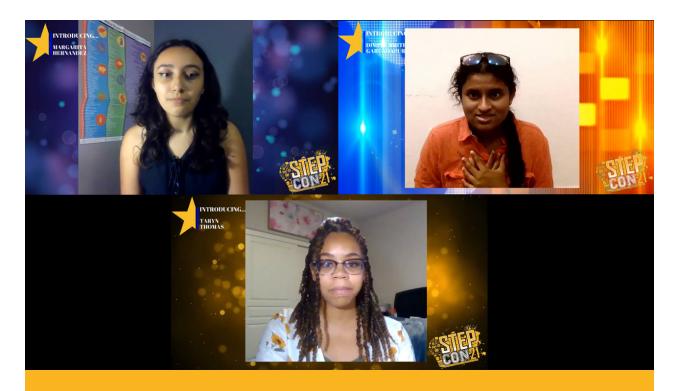
Our three STEM Scholarship Recipients!

A highlight of our last three educator conferences has been the recognition and awarding of scholarships to outstanding Inland area youth from both San Bernardino and Riverside Counties. Applicants must demonstrate the impact and effect of STEM education on their lives through a pre-recorded video presentation. Recognized applicants receive the opportunity to address conference participants through a general session presentation. This year it was our pleasure to award $1,000 scholarships to three very deserving students whose stories and experiences resonated with our committee and educators everywhere. As the conference was fully virtual this year, their videos were instead featured on our conference virtual platform and youtube channel: